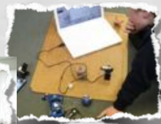
Discovery at Swainswick

Everyone Starts With A General Passion For Learning & Can Develop Particular Passions For Learning.