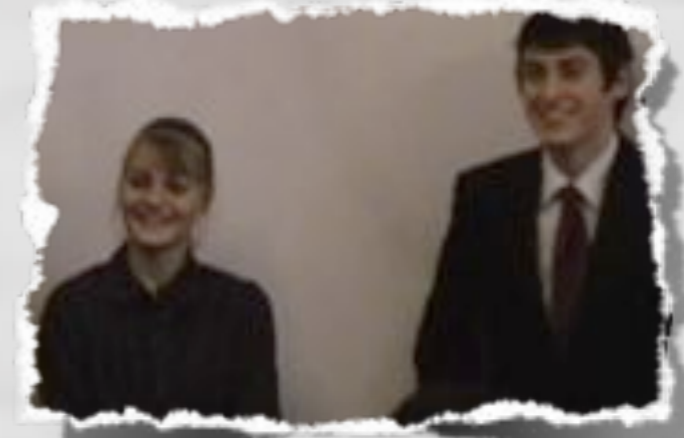
Research communities at Wellsway

As We Create, Offer & Thoughtfully Value Gifts We Enhance Our Own Learning & Life & That Of Others.