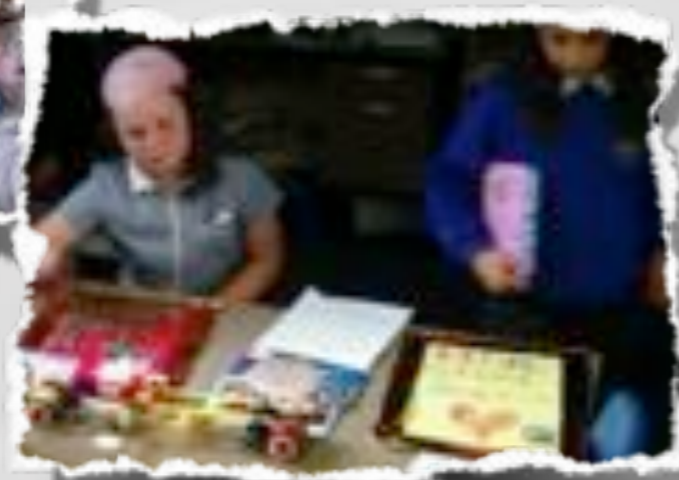
TASC Days at Camerton